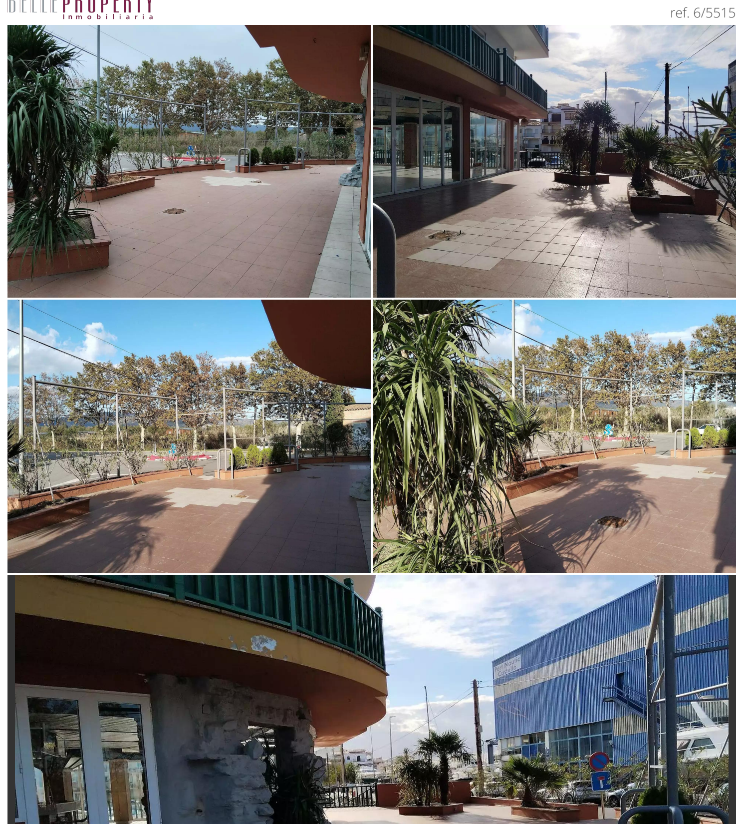
Belle Property, Avda Joan Carles I, 10 Local 2, 17487 Empuriabrava - Girona