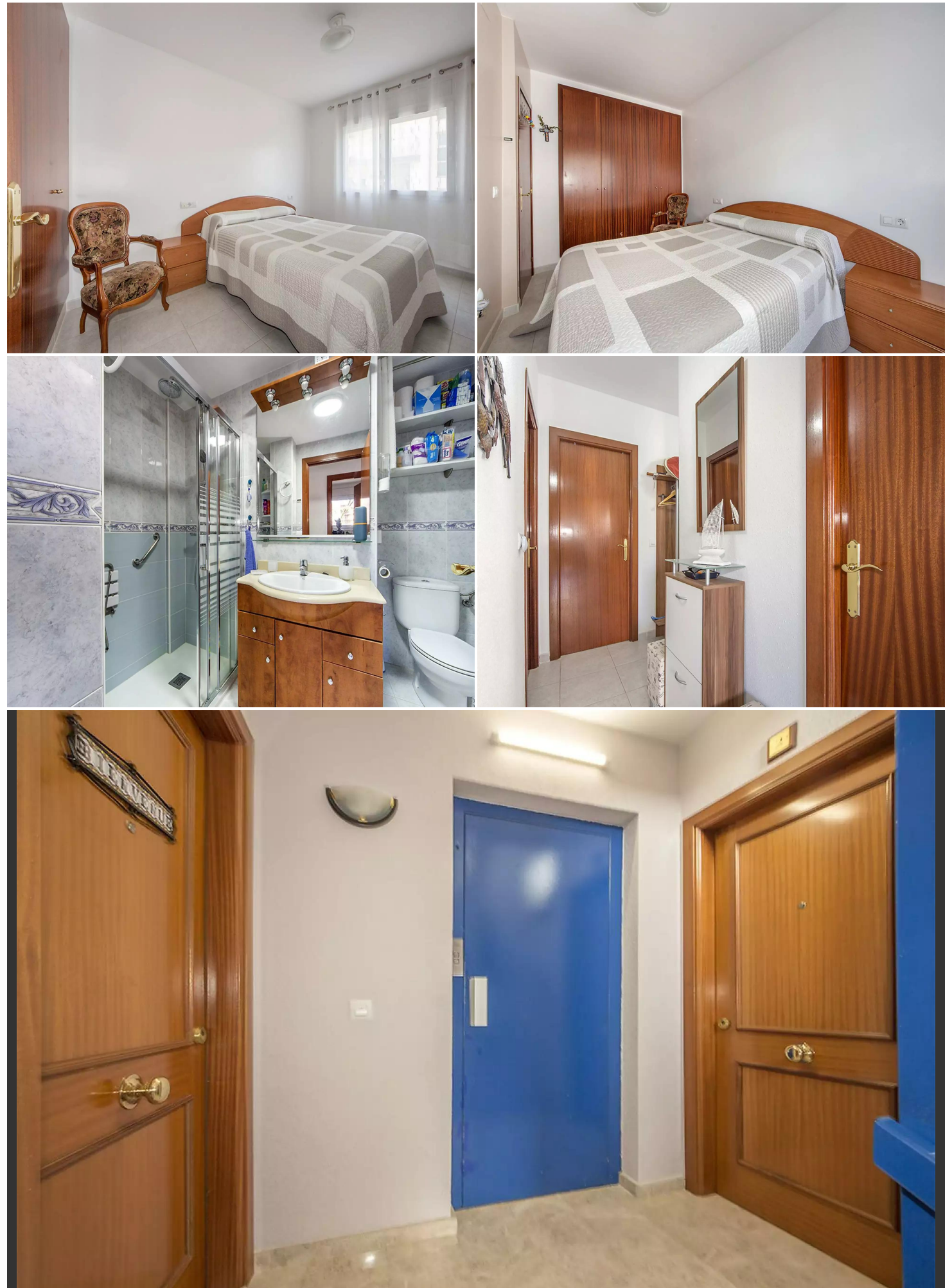
Belle Property, Avda Joan Carles I, 10 Local 2, 17487 Empuriabrava - Girona